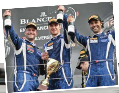
EMIL FREY RACING TEAM