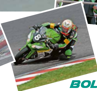
BOLLIGER TEAM SWITZERLAND